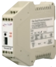
PID Controller / Signal Conditioner / Trip Amplifier