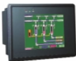
HMI Operator Interfaces