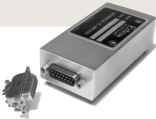
Model 416 rear view, with mating DAM-15S connector

Featuring complete ohmic isolation between the signal input, output, excitation, power supply, and case, it is a solid-state chopper-stabilized differential dc amplifier with an internal excitation voltage supply. The high input impedance permits operation with a large variety of signal sources; and the low output impedance allows operation into highly reactive loads, telemetry equipment and most recording and/or storage devices.