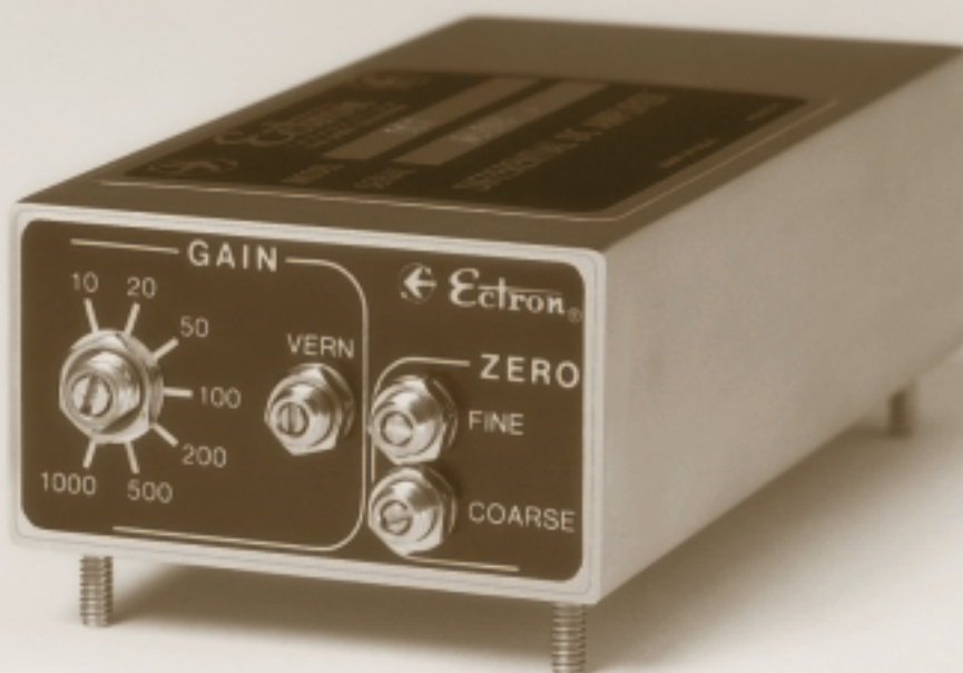
Model 416 front view. See specifications for size.