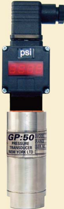
Seen here with GP:50's Model 311 pressure transmitter