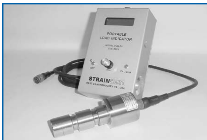
Strainsert Model PLN-D2 with CPA Series Clevis Pin

Optional Protective Carrying Case – Model PLN