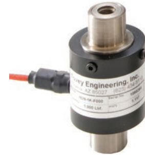
Note: shown with Optional Female Threads.