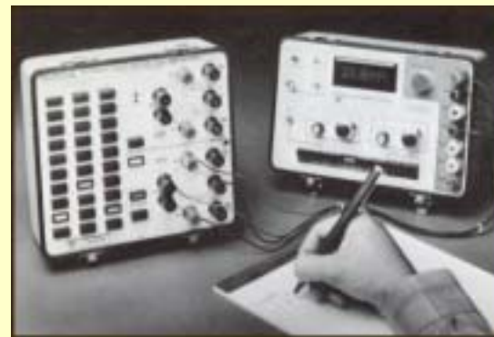
Calibration verification of the P-3500 Portable Strain Indicator before an important test.

A calibrator based on the Wheatstone bridge principle requires stable components. A total of 66 ultra-stable Vishay precision resistors are used in the Model 1550A calibrator to provide the stability, repeatability, accuracy and incremental steps required in a laboratory standards instrument.