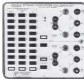
A Certificate of Calibration is provided with each Model 1550A Calibrator.

All specifications are nominal or typical at +23^{\circ}\text{C} unless noted.