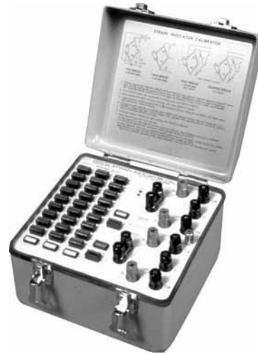
A laboratory standard for verifying the calibration of strain and transducer indicators.